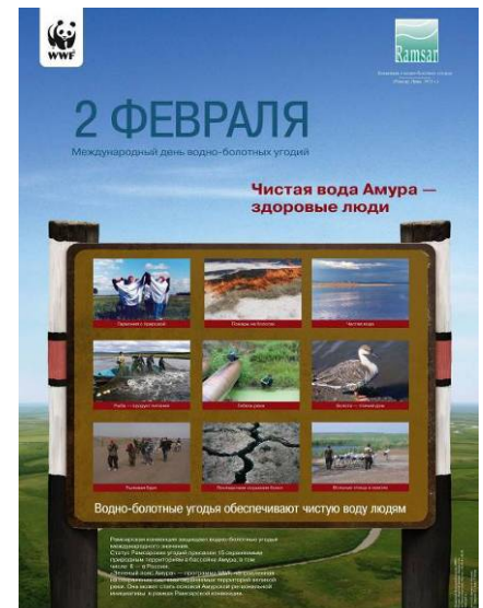
Such poster was produced marking the start of the Year for Ramsar Wetlands ( by WWF Russia)

To date, to celebrate the Year for Ramsar Wetlands lots of different activities have been conducted. In Chitinskaya, Evreiskaya, Amurskaya, Khabarovskii and Primorskii provinces hundreds of people have visited fests, photo exhibitions, and press conference. Not to mention that the start of the Year has coincided with a remarkable event – signing of the Agreement between Russia and China on sustainable use and protection of transboundary waters.