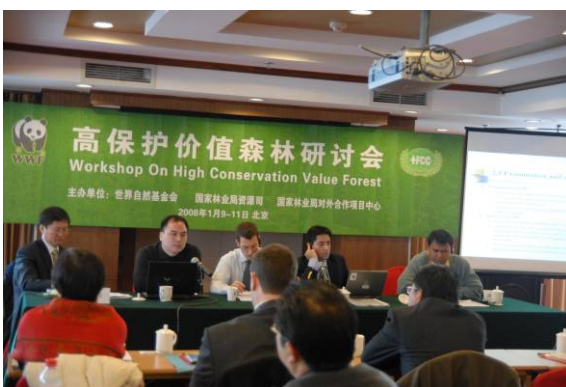
HCVF workshop

From Jan 9 th to 11 th , 2008, the HCVF workshop was held in Beijing. More than 100 forest program officials and experts from WWF, Resources Department and Foreign Cooperation Program Center of State Forest Bureau, etc took part in the workshop. The workshop aimed to share HCVF program experiences, promote HCVF concept in government agencies, forest managers and scientific and research institutes who are interested in sustainable forest