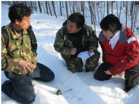
Sino-Russia border survey

Recovery of Amur tiger and leopard population in the Changbaishan Landscape depends heavily on proliferation of tigers and leopards from Southwest Primorye, Russia. Hunchun-Wangqing-Dongning areas are near Sino-Russia border, which is the main eco-corridor for the movement of tigers and leopards between Russia and China.