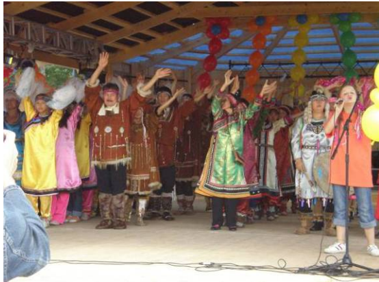
The future of the Bikin River is in hands of local aboriginals

Children, young people and women will be encouraged to participate in the workshops and center's activities, while economic opportunities are created through marketing local products and promoting small-scale ecotourism in the Bikin area. The cultural centre will be made a real community centre also thanks to a legal aid office offering legal advice, opportunities for participation in decision-making and advocacy for the establishment of a "Territory for Traditional Nature Use". Partners of the project are WWF Germany, WWF Russia, NGO "Association of Indigenous People of the Primorskii Province", Russian Association of Indigenous Peoples of the North, non-commercial association "Tribal Commune 'Tiger', Municipality of Krasny Yar village and Village Council of Deputies.