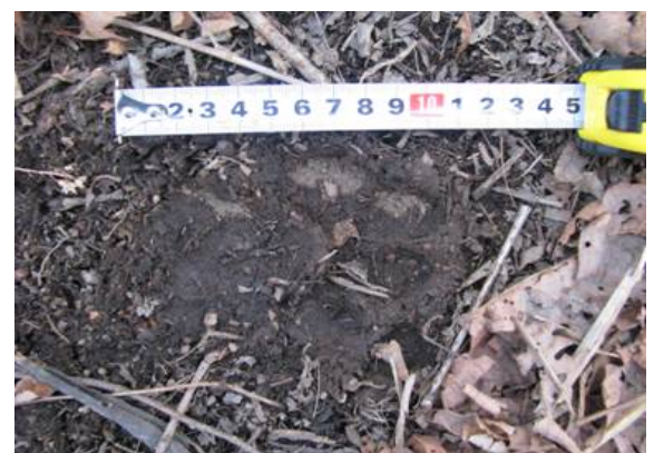
Leopard track in Hunchun sino-Russia Survey

During the survey, WWF China Harbin Office staff and nature reserve staff found tiger and leopard tracks, roe deer lying tracks, and wild animal droppings. This survey not only provides evidence to formulate regional Amur tiger and leopard conservation plan, but also promotes the application of unified monitoring methodology of Amur tiger/leopard and ungulates in AHEC NEC.