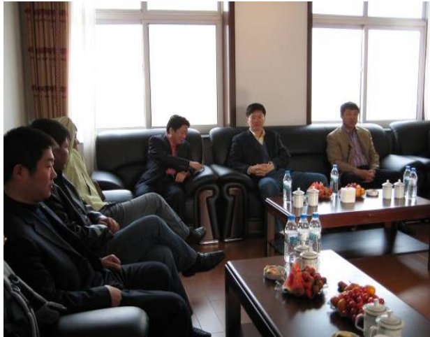
Meeting with Hunchun NNA