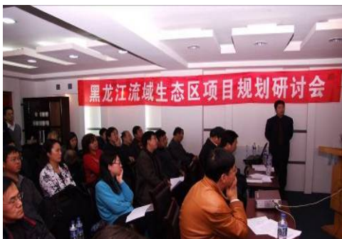
AHEC planning workshop in Changchun