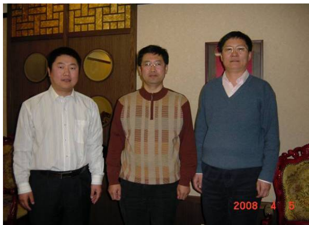
Meeting with Head of Jilin Forest Administration