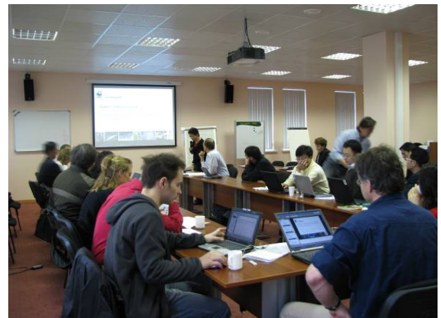
Planning workshop in Vladivostok

WWF RFE, WWF Mongolia and WWF CPO introduced three-year planning log-frames and figured out potential transboundary activities and support from each side, such as conducting Free Flowing report in each country and integration into trilateral report for publication; Jilin, Heilongjiang Provincial delegation exchanging with RFE the successful experiences of forest fire control, while China side learning from RFE the Amur tiger, leopard and ungulates conservation approaches; and exchanging information about HCFV certification, etc.