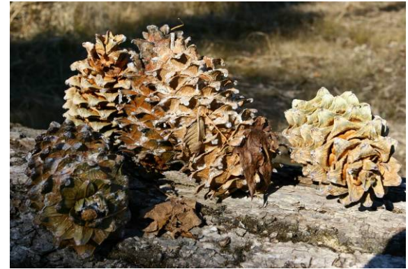
People should take nuts from the Korean pine and not timber (by D. Kuchma WWF)

For the first time logging company pays attention to complex forest use. "Primorskii GOK" has leased large area of Korean pine nuts harvesting zone to use non-timber forest products as the main type of forestry. The leased area located in the north of Pimorskii province is 95 303 ha of intact Korean pine forests that have protective status and are home for the Amur tiger.