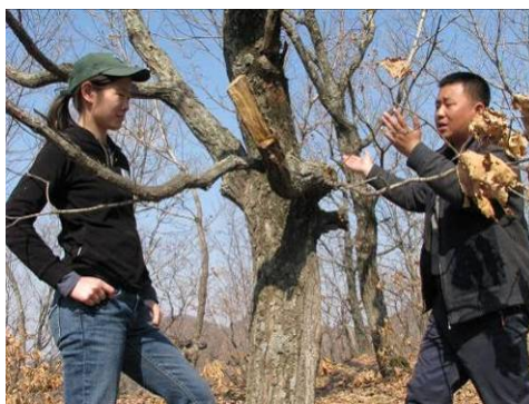
Field trip in Jingxin