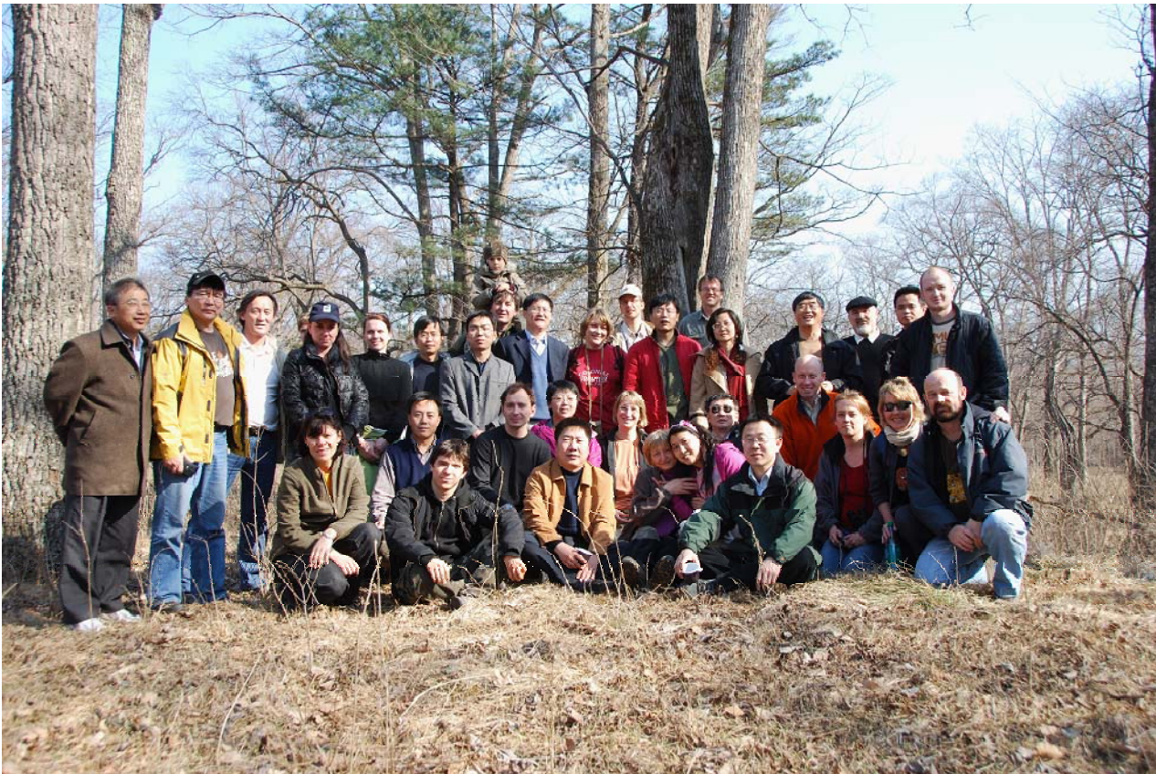
Field trip in Russia

As WWF people, as AHEC conservation drivers, we feel pride for what we are doing for this beautiful and living complex. We share one land, we share one river, we love the same animals and we share one similar wish: AHEC is our home----home for Amur tiger and leopard, home for Kaluga, sturgeon and Taimen, home for vast forests, and home for a free flowing river! So let's speak in one coherent voice: We are WWF people, who will certainly realize the wish!